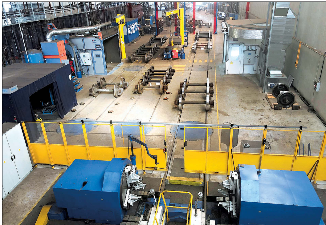
A new line for wheelset repairs and revisions

1. máje 3302/102A, 703 00 Moravská Ostrava a Přívoz Czech Republic