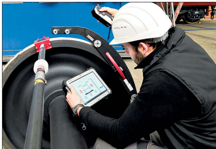
A wheelset diagnostics