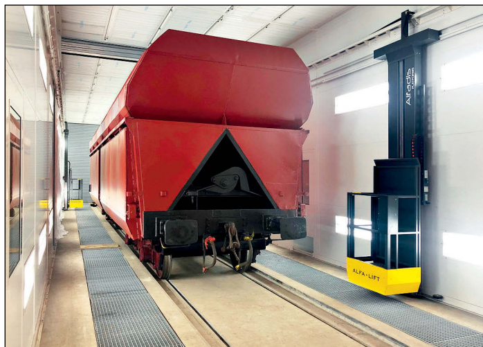
A painting box